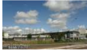
Lycée des Métiers Augustin Hébert, Evreux.